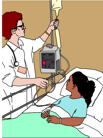
Oklahoma Health Center (Oklahoma City)